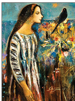
LESSON SEVEN Sabbath and Self-Care