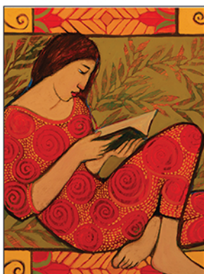
LESSON FIVE Sabbath and Servitude