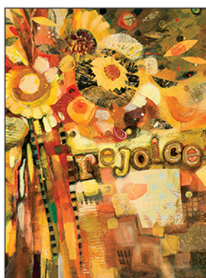
LESSON ONE Sabbath and Celebration

*Note that prices do not include shipping and handling ($6.25 minimum). International orders and orders to Puerto Rico incur additional shipping charges. Prices, availability, and shipping charges are subject to change without notice.