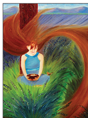
LESSON TWO Sabbath and Creation