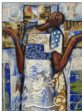
LESSON FOUR Sabbath and Surrender