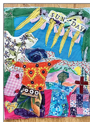
LESSON THREE Sabbath and Sunday