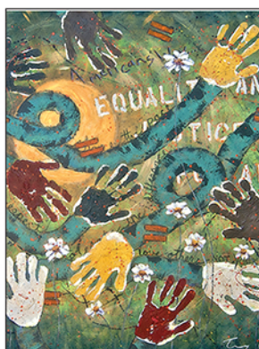
LESSON EIGHT Sabbath and Justice