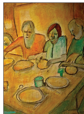
LESSON SIX Sabbath and Hospitality