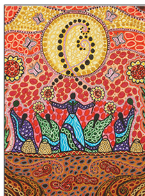
LESSON NINE Sabbath and Community