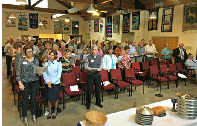
Morning Worship - 2017 Spring Stated Presbytery Meeting