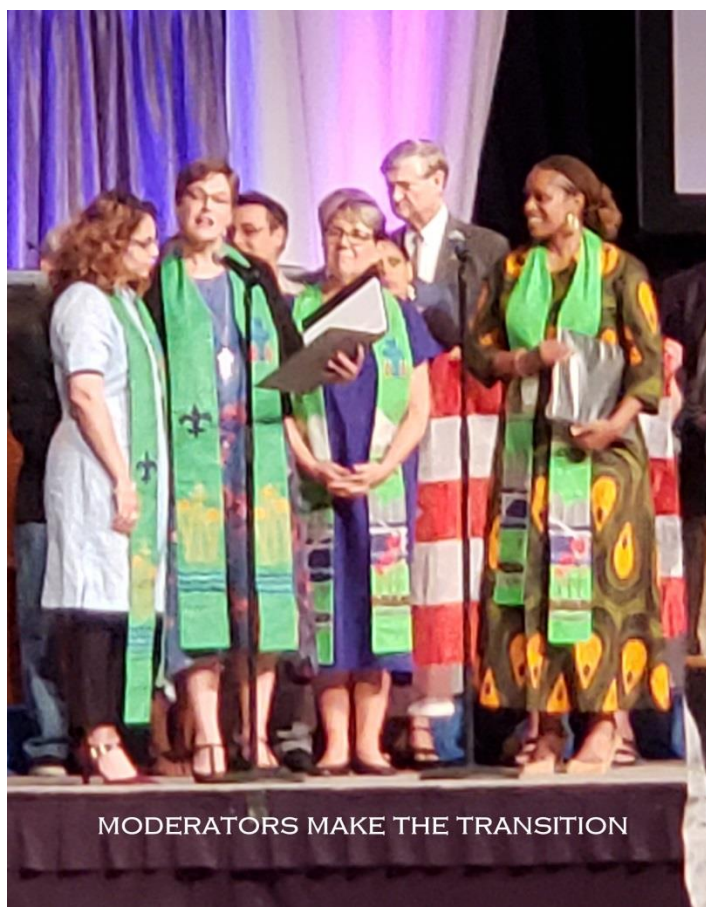
MODERATORS MAKE THE TRANSITION