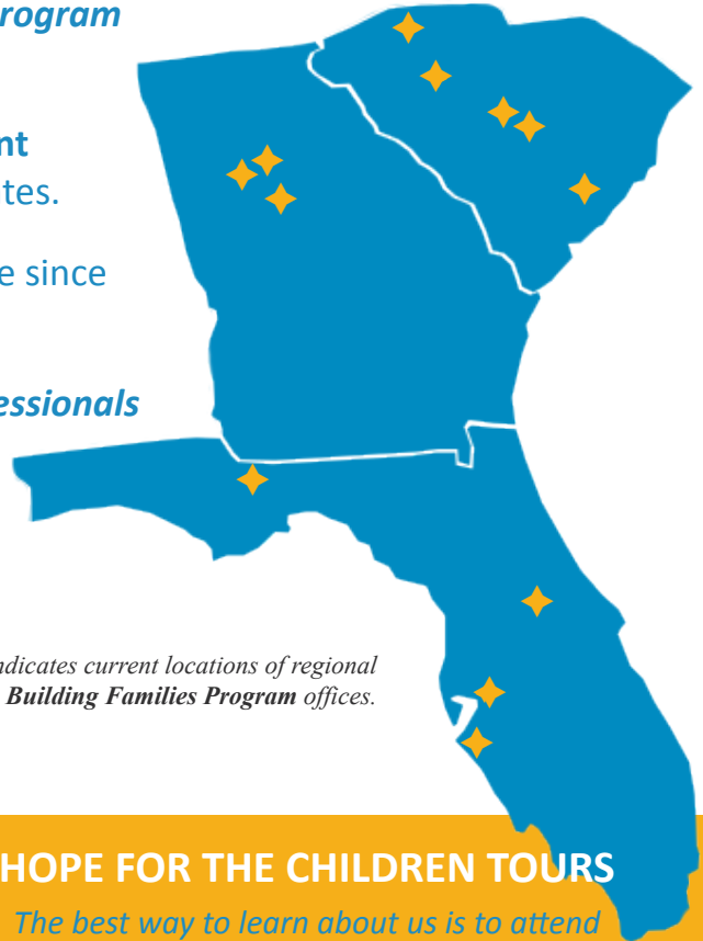
◆ - Indicates current locations of regional Building Families Program offices.